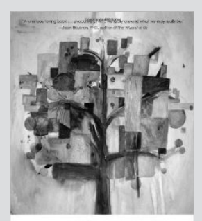
the gifts of grief FINDING LIGHT IN THE DARKNESS OF LOSS THERESE TAPPOUNT

Tett G (2014). How to mourn online. Financial Times Weekend Magazine , June 28/29 46.